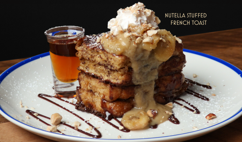
NUTELLA STUFFED FRENCH TOAST

SATURDAY MAY 11 TH - SUNDAY MAY 12 TH | AVAILABLE UNTIL 4PM